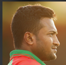
Shakib Al Hasan