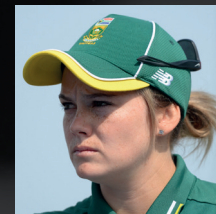
Dane Van Niekerk